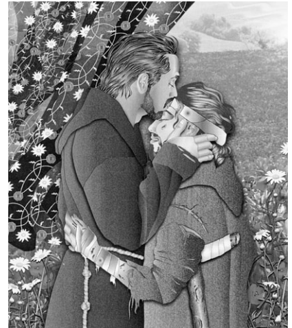
Clothed in Splendor

Francis "who read the Gospel with the concerns of his times in mind, created something new. . . ."