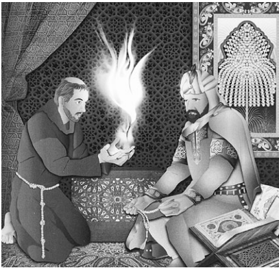
Path of Peace

"one of these exceptional encounters between the Gospel and history"